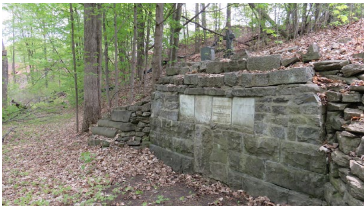
Figure 1. Stevenson vault in Sec. 61 as it appears today, with remnant of original roadway. The blocked-up doorway is visible below the two central inscription slabs.

MATTHEW S. STEVENSON / [blank line] / JAMES STEVENSON / ANN STEVENSON