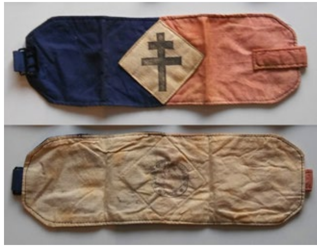
Lucien Durocher's armband worn while behind enemy lines in southern France (1944)